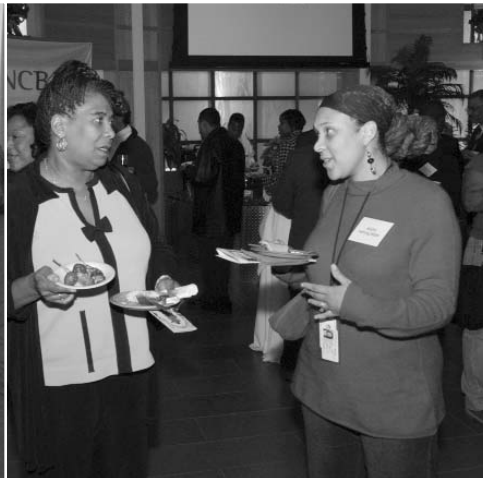
Guests took the opportunity to network with other event attendees while sampling the culinary creations of PDP's entrepreneur clients.