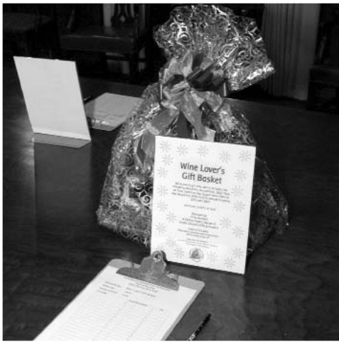
Guests at PDP's Holiday Bake-off were able to bid on one of 12 silent auction items, including the Wine Lover's Gift Basket seen here.